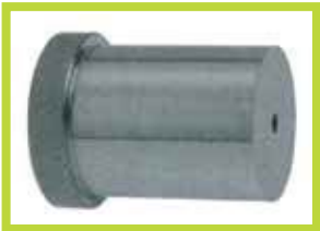
Materiale: Acciaio A2, HRC 58-60 Material: Steel A2, HRC 58-60