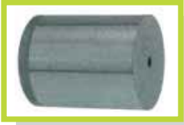
Materiale: Acciaio A2, HRC 58-60 Material: Steel A2, HRC 58-60